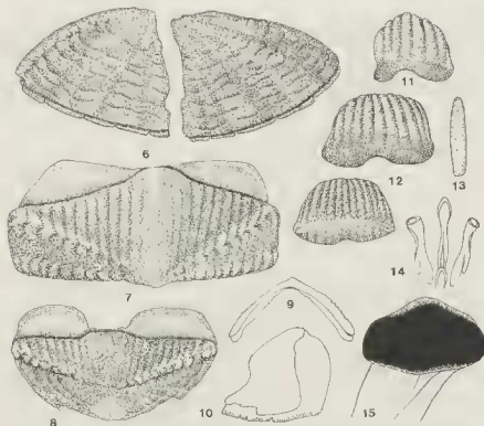
6-15. Chiton (Tegulaplex) bouchei sp. nov. (holotype).

6, valve I, dorsal view, \times 19 ; 7, valve VI, dorsal view, \times 19 ; 8, valve VIII, dorsal view, \times 19 ; 9, camera lucida sketch of valve VI, rostral view, \times 9 ; 10, do, valve VIII, lateral view, \times 19 ; 11, dorsal girdle scale near to the outer margin, \times 187.5 ; 12, scales from mid-girdle, a dorsal, b ventral view, \times 187.5 ; 13, ventral girdle scale, \times 187.5 ; 14, central and first lateral radula teeth, \times 375 ; 15, dental cap of major lateral tooth, \times 375 .